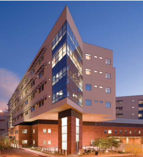
Barrow Neurological Institute, Phoenix, AZ, USA

During the course, there will be several operations per day. Professors will discuss the cases and present microsurgical videos between and after the operations. The operative schedule runs every day, with simultaneous hands-on opportunities throughout the day on models, highlighting the safe application of aneurysm clips.