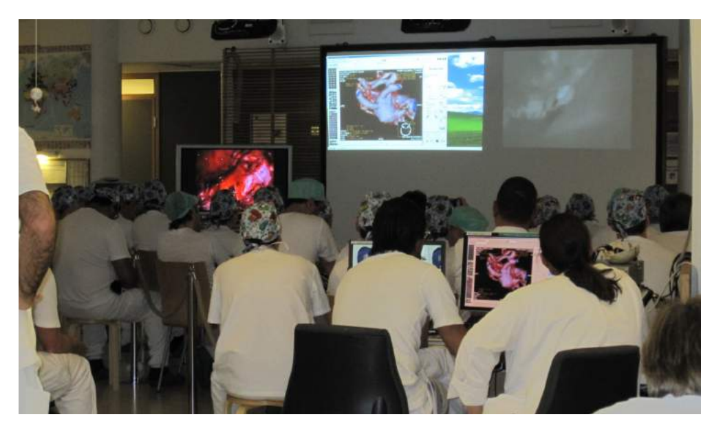
Course participants during the course