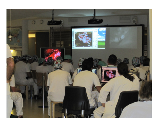
Course participants during the course in 2010